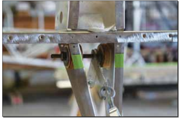
Temporary anchors secure the aileron to jig.

solvent to make a paste, then paints the paste inside the end of each tube before positioning for the weld. The result is a clean, sugar-free joint, without the setup time or cost of argon gas.