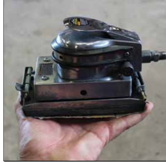
The secret weapon—a $26 jitterbug sander from the import tool store.

Topcoats vary depending on aircraft type. The restoration of a certified production aircraft requires a restorer to follow the covering system STC in detail. In the case of Poly-Fiber, the STC requires using Poly-Tone or Aerothane color coats. There is no such requirement for an aircraft licensed in an Experimental category, and for those the Kimball preference is for PPG products. A typical application uses a