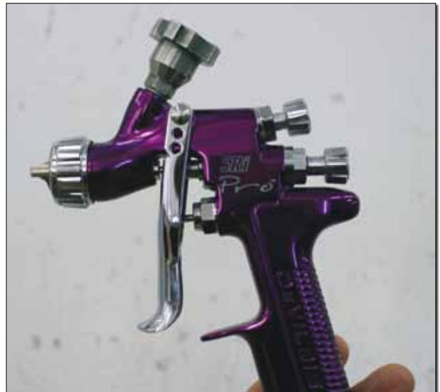
DeVilbiss SRI Pro for trim colors and details.