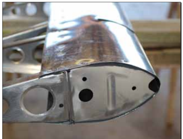
Only the spar line and end ribs are riveted.