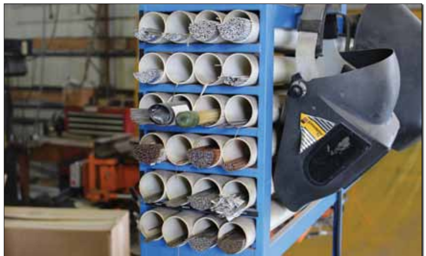
Left: Jeff Woodham. Right: A filler rod for every purpose; aluminum, stainless, 4130, titanium, and more.