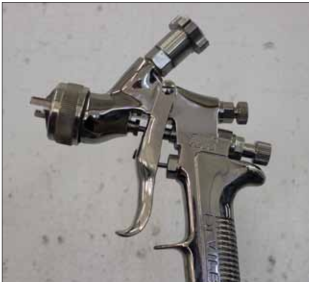
DeVilbiss GFG670 Plus for big panels.

With all the colors in place, the next step is usually three coats of clear. If the scheme includes airbrushed detail, the