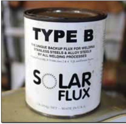
Solar Flux allows welding stainless tube without a back-gas purge.

cured clear will be wet-sanded, then airbrushed, then covered with two more clear coats. Although the finished clear on metal components can be cut and buffed, Clint avoids running a typical 1900 RPM buffer on fabric, as the frictional heating under the spinning pad can do funny things to heat-shrunk polyester.