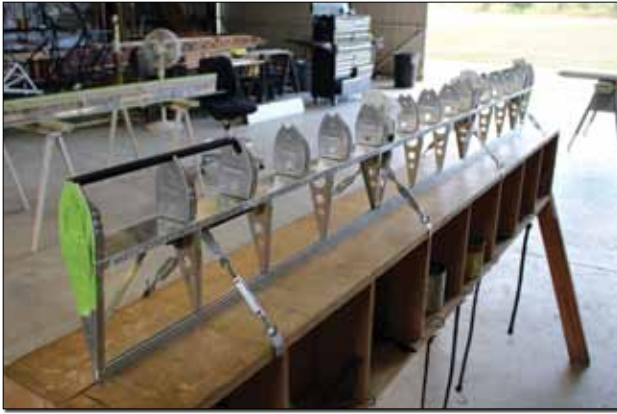
An aileron perfectly aligned in the jig.