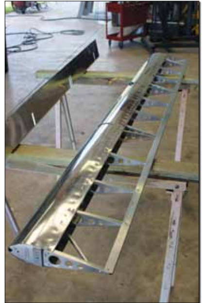
Completed aileron. Despite the length, this Kimball design does not need spades.

fixture. The basic table structure is a stiff glued-and-screwed box. A groove just wide enough to cradle the trailing edge material runs down the centerline of the top surface.