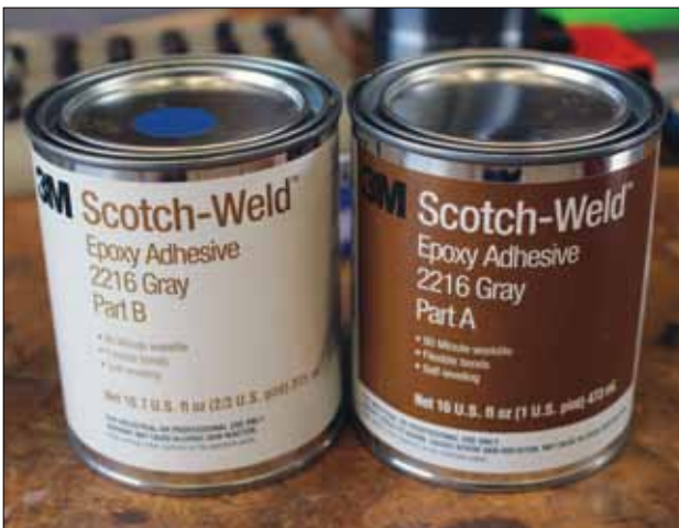
3M structural adhesive for metal-to-metal bonding.

In the Kimball shop it is done with the assembly standing vertical in a special