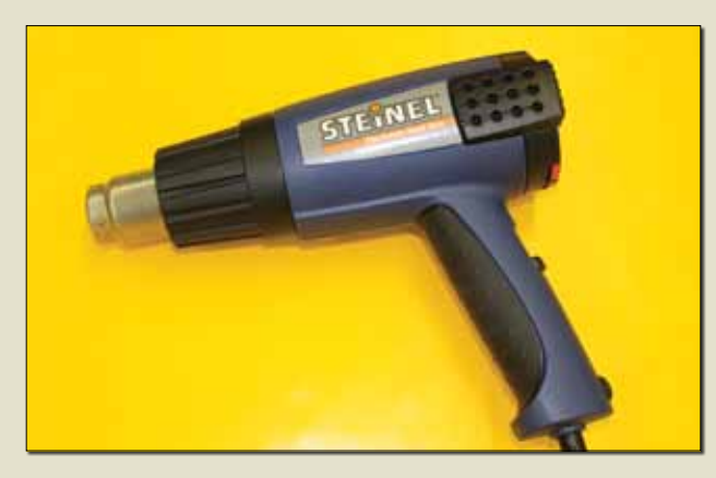
The Steinel HE2010E heat gun provides full digital control of output temperature, ranging from 120° F to 1150° F, in 10° F increments.

Everyone liked the Toko iron, but we found it had two drawbacks when applying Oratex to riveted aluminum structure. The baseplate incorporates channels with sharp edges intended to help spread ski wax. The channels tend to catch on protrusions like rivet