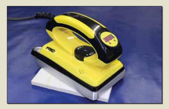
This Toko T14 digital iron was originally intended for applying wax to skis and snowboards. Its primary feature is extremely accurate temperature control.

A digital iron like the T14 controls temperature with a microprocessor rather than a thermostat. It has no low and high ON-OFF