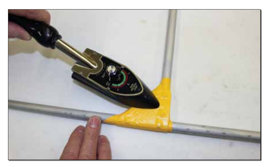
Fig. 3: Cut a patch of adhesive-coated fabric about a quarter-inch larger than the object to be covered and iron it into place.

The actual iron setting needed to get the glue to 158° F will vary depending on