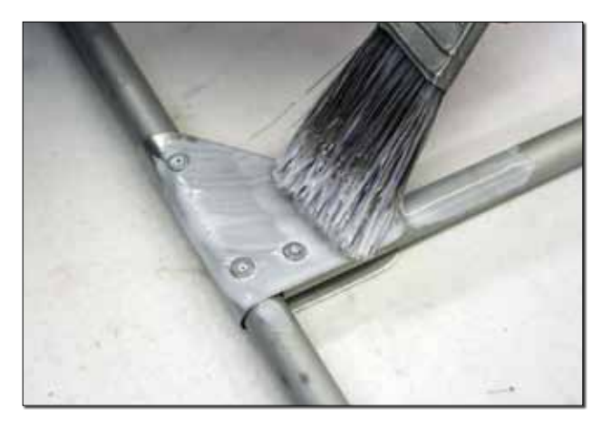
Fig. 1: After a thorough cleaning, scuff the parts to be covered with a mild abrasive, then apply Oratex adhesive with a brush.