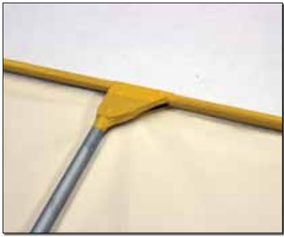
Fig. 5: This is how a completed section looks; it's important to go slow, apply pressure to the iron, and heat every square inch.

Lay the structure on the plain side of a fabric panel. Draw around the perimeter with a #2 pencil, then outline ribs or other structure that will also be glued to the fabric. Cut the panel to rough shape, leaving plenty of excess fabric (6 to 8 inches) outside the perimeter at curved sections. The excess offers something to grab and pull, as the fabric needs to be stretched around curved tubes. Brush a layer of adhesive just inside the perimeter line, several inches outside, and along the rib lines. The goal is simple; you want