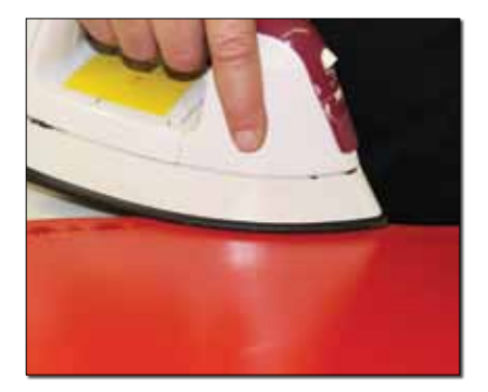
Fig. 9: When heat is applied to the center of the tape, it stretches enough to allow the non-heated, and now shorter edges to lie down. They can be smoothed with an iron.

The Oratex process is, as promised, very clean. There is no smell or airborne vapor.