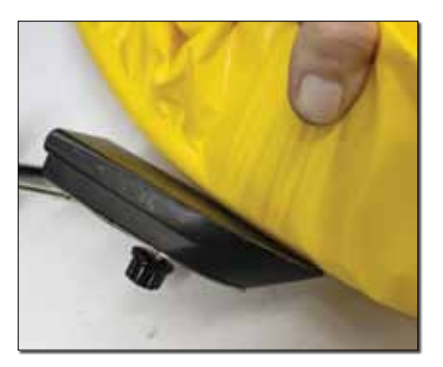
Fig. 6: On curved sections, pull the fabric with one hand while ironing it with the other.

Go slow, apply pressure to the iron, and be sure to heat every square inch. Straight sections are easy. Curved sections may require cutting small darts so the fabric will wrap without bunching.