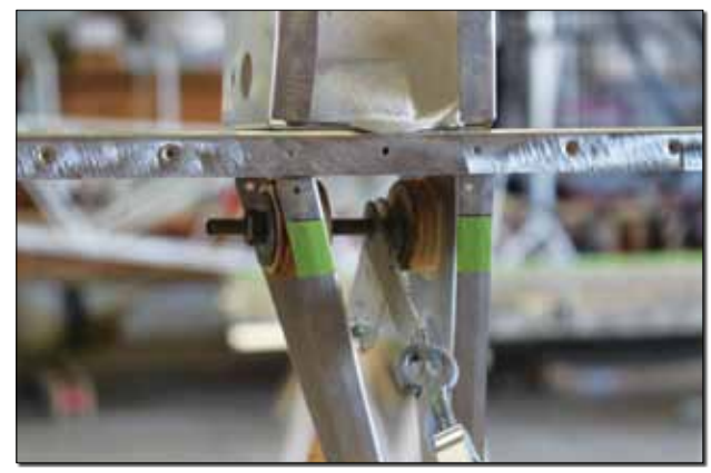
An aileron perfectly aligned in the jig.