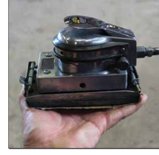
The secret weapon— a $26 jitterbug sander from the import tool store.

Topcoats vary depending on aircraft type. The restoration of a certified production aircraft requires a restorer to follow the covering system STC in detail. In the case of Poly-Fiber, the STC requires using Poly-Tone or Aerothane color coats. There is no such requirement for an aircraft licensed in an Experimental category, and for those the Kimball preference is for PPG products. A typical application uses a