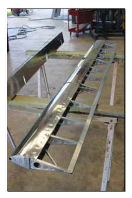
Completed aileron. Despite the length, this Kimball design does not need spades.

fixture. The basic table structure is a stiff glued-and-screwed box. A groove just wide enough to cradle the trailing edge material runs down the centerline of the top surface.