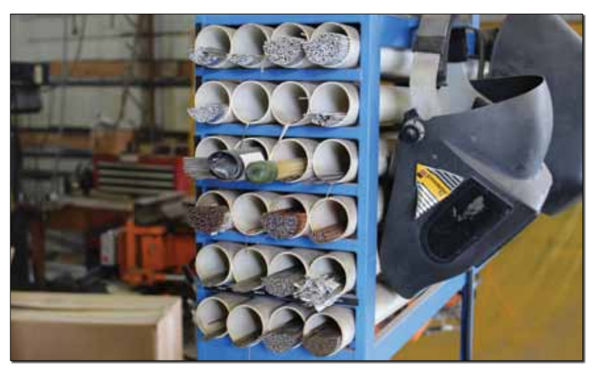
Left: Jeff Woodham. Right: A filler rod for every purpose; aluminum, stainless, 4130, titanium, and more.