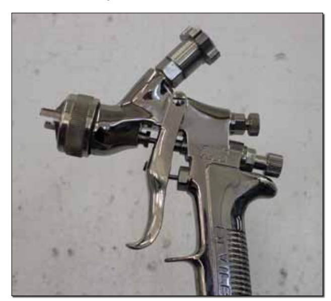
DeVilbiss GFG670 Plus for big panels.

With all the colors in place, the next step is usually three coats of clear. If the scheme includes airbrushed detail, the