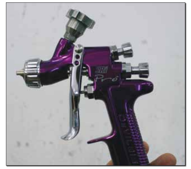
DeVilbiss SRi Pro for trim colors and details.