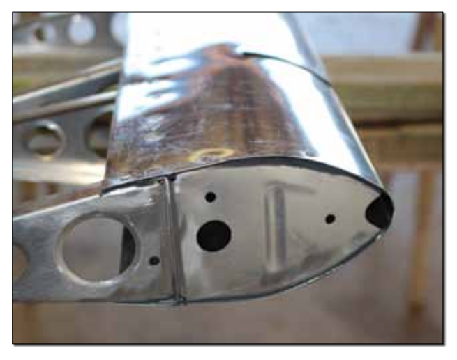
3M structural adhesive for metal-to-metal bonding.